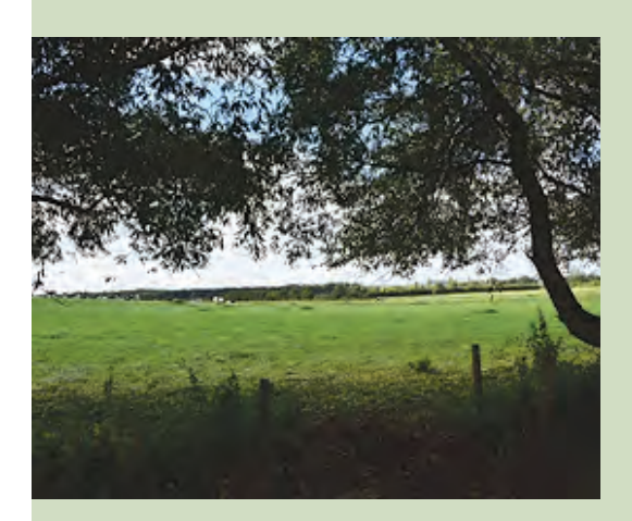
Green Lane bridleway

Green Lane bridleway is key because it provides access from Appleton Village to the River Thames at Appleton Landing and to a network of footpaths including the Thames Path via Rainbow Bridge (which is in Fyfield and Tubney Parish).