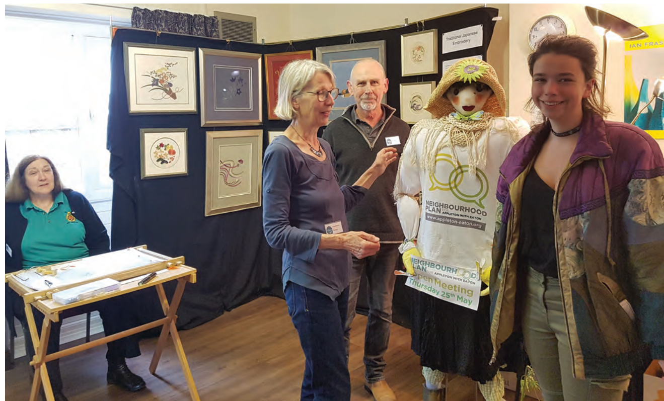
Hattie the Scarecrow at Artweeks - May 2017