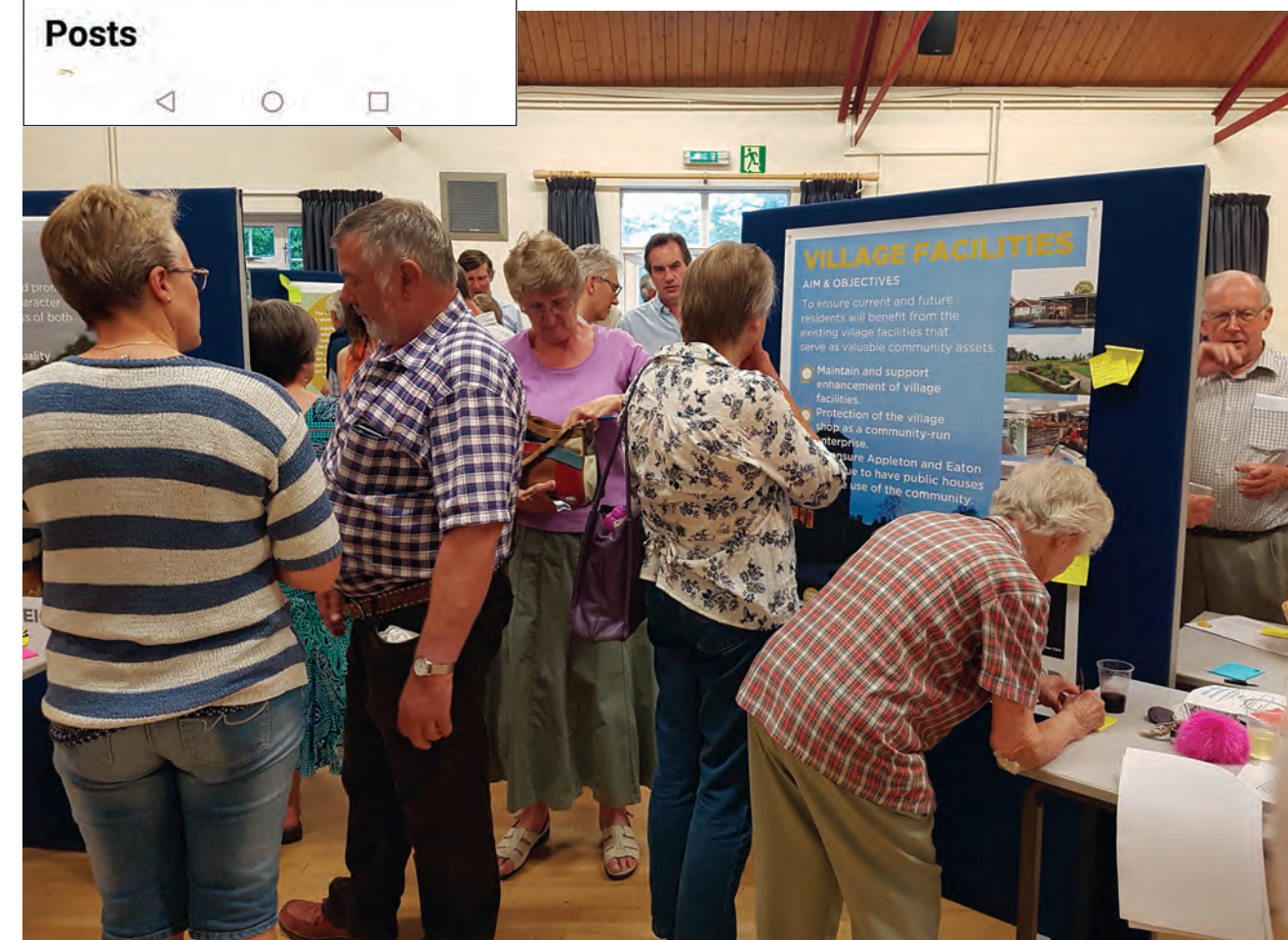
Advertising at the Public Consultation meeting of 25th May 2017