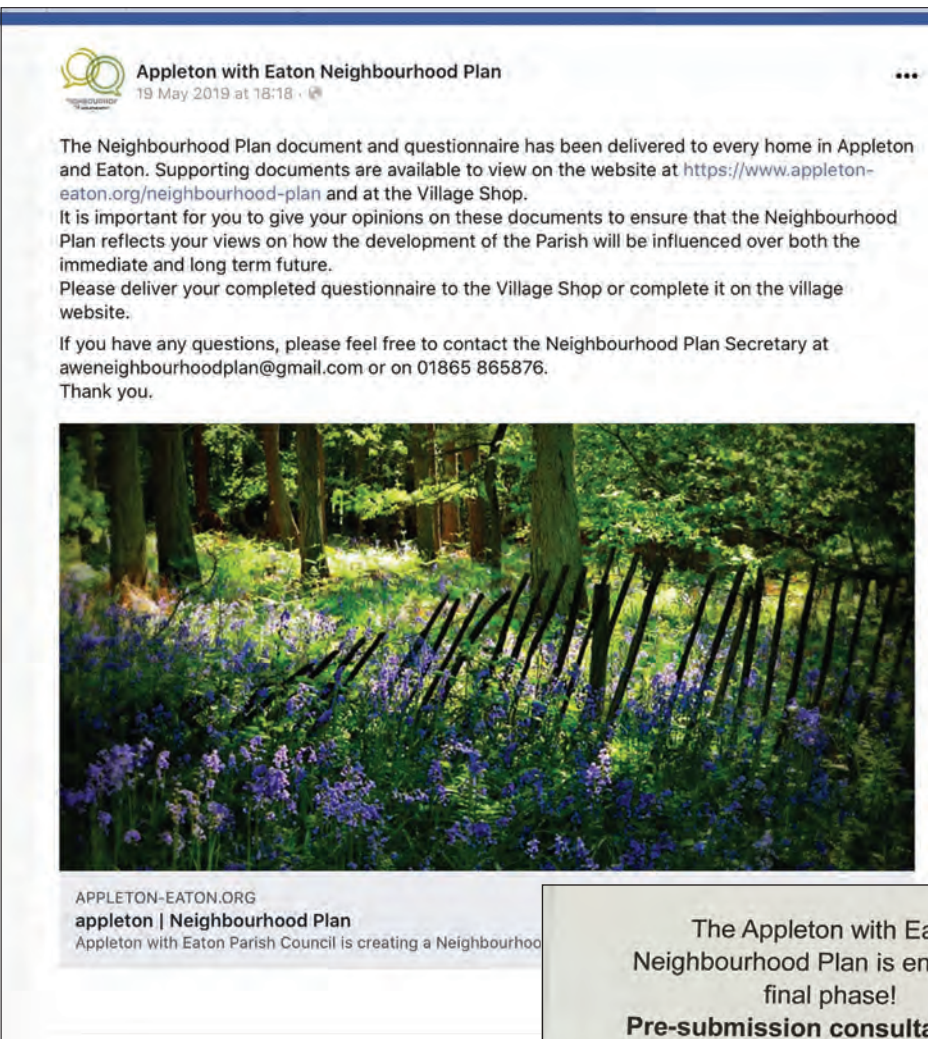
Facebook page announcing the Pre-submission Consultation Phase – May 2019