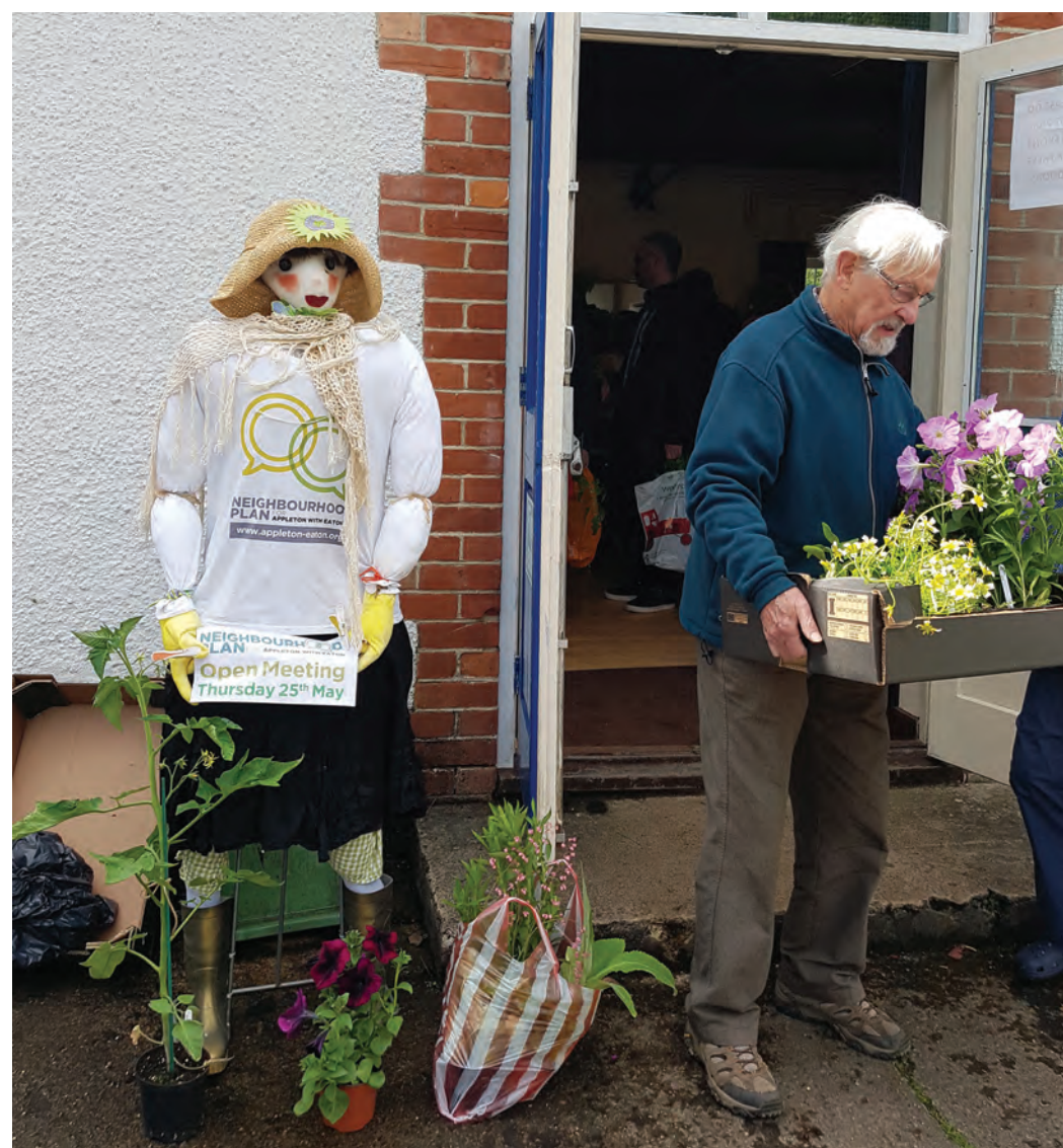
Hattie the Scarecrow at the Gardening Club plant sale - May 2017