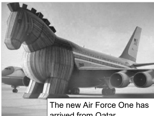
The new Air Force One has arrived from Qatar