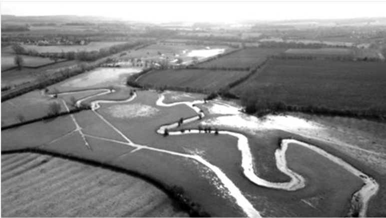
Evenlode river near college farm, Bledington (David Gasca) March 2021

Wildlife corridors: living tapestries woven together to produce a natural passage connecting fragmented habitats. These vital tapestries allow animals to safely migrate, find food, reproduce, and adapt to environmental changes while keeping our landscape functioning as a single, connected system rather than a scatter of isolated fragments. Thus, migration is the key behavioural adaptation that allows nature to thrive.